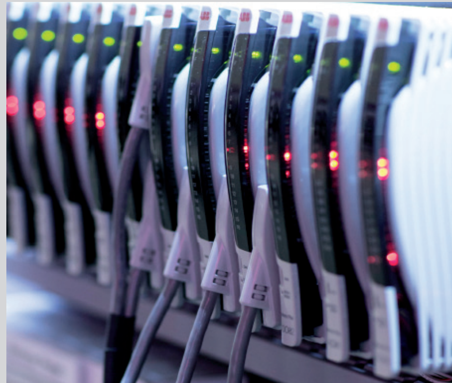
ABB Ability™ Symphony® Plus SD Series Control and I/O