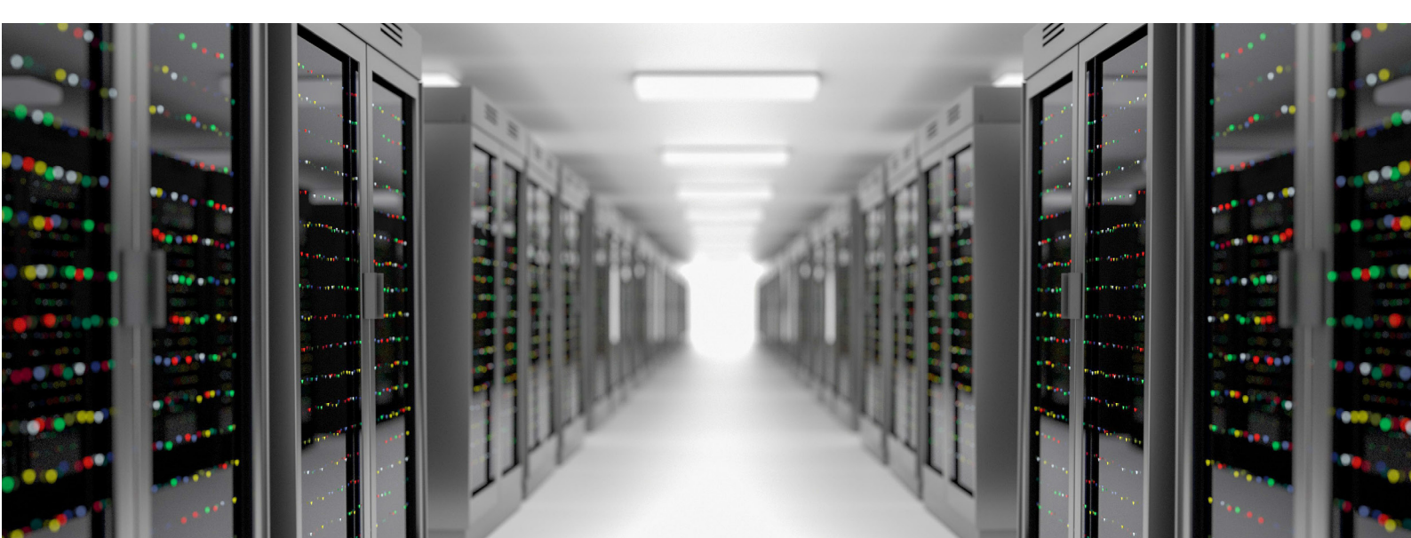
01. Operating at MV levels allows the HiPer-Guard to supply power protection to large data centers – at lower overall cost.

In addition to its core purpose as a load protection system, the ABB HiPerGuard MV UPS ZISC topology is also ideal for injecting real power into – or absorbing it from – the electrical network on request from an external power plant controller