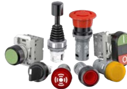
Operators, pilot lights and signalling devices Pilot devices Robust and reliable.