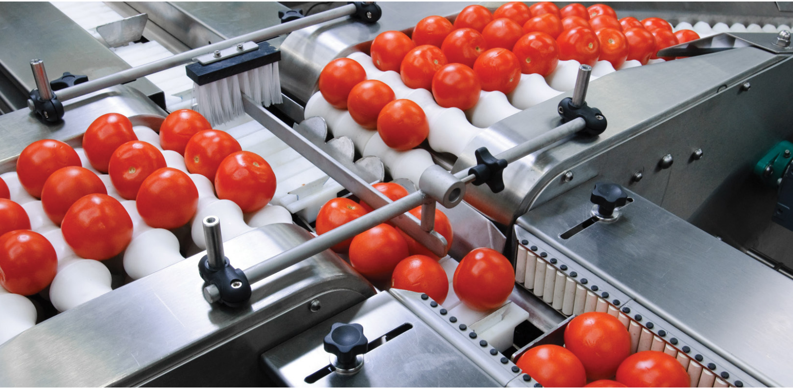
ABB has a long experience of developing safety products and solutions adapted for the harsh environment and requirements in food and beverage industry.