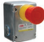
EStrong Emergency stop Robust design and reliable in harsh environments.