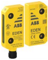
Eden Non-contact sensor Easy to install, highest level of safety and high reliability.

Thanks to a close cooperation with ABB Robotics and as a longtime member of the ISO international robotics committee, ABB Safety Products has many products and solutions well suited for the robotics industry.