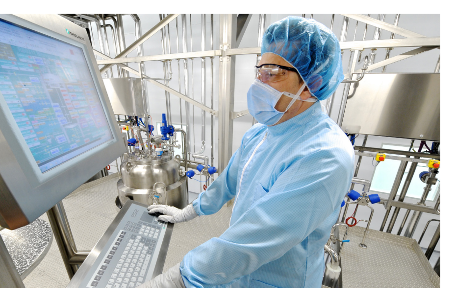
ABB Ability Manufacturing Operations Management (MOM) with Shop Floor Integration Batch provides a qualified, flexible, cyber secure and easy to engineer solution from shop floor to ERP. It helps our customers in the manufacturing industries such as life science and food & beverage meet their regulatory requirements, produce high product quality, achieve fast time to market and benefit from significant cost savings.

Today many Production Management solutions for the life science industry are still not or less integrated, requiring high efforts in engineering and synchronization of data between MES (Manufacturing Execution System) and DCS (Distributed Control System). Especially in GMP plants (GMP = Good Manufacturing Practices) this has as a crucial influence on time to market, quality and profitability. The challenge for Automation suppliers is to create an efficient workflow, fulfilling FDA regulations following GAMP5 guideline (ISPE) for engineering and validation and ensuring data integrity.