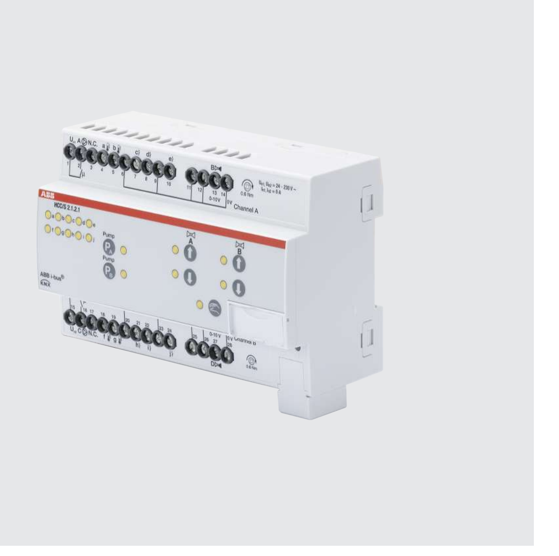
ABB i-bus® KNX HCC/S 2.1.2.1 Heating/cooling circuit controller