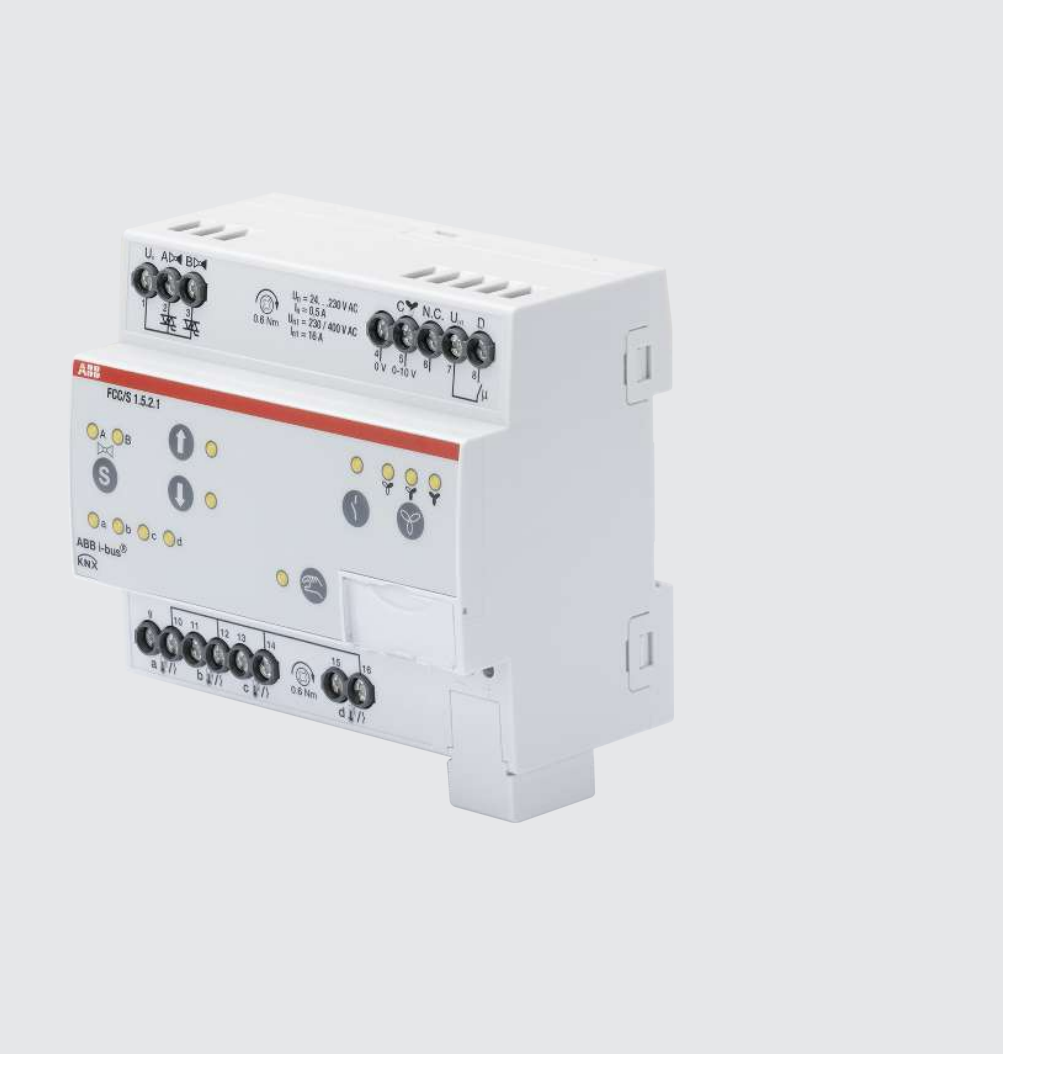
ABB i-bus® KNX FCC/S 1.5.2.1 Fan Coil Controller, PWM, MDRC