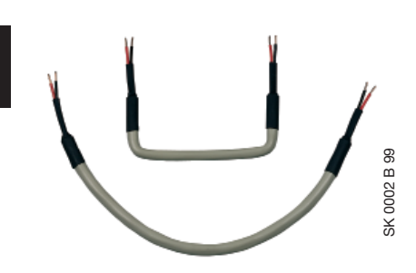
ABB i-bus<sup>®</sup> KNX Wiring Jumpers VB/K xx0.1, GH Q630 1908 R000x

The wiring jumpers VB/K 360.1, VB/K 270.1, VB/K 200.1 and VB/K 100.1 are used to connect devices to the KNX that have a bus connecting terminal at the front of the device. They are suitable for wiring in the distribution boards as well as in the control cabinet or a longer mounting rail. There are no limitations regarding length as there are for the data rail and a connector is not required.