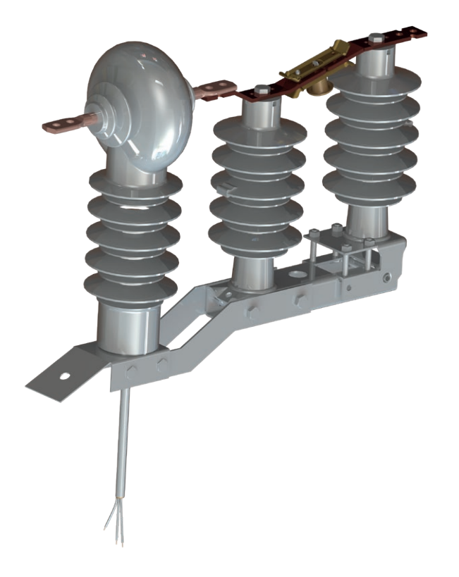
Figure 1, example of installation of the KOHU current transformer with NPS switch

* maximum burden depends on the other parameters.