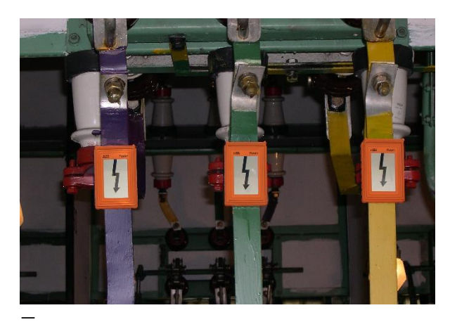
Example of VisiVolt™ indoor installation

There are a huge number of locations on a distribution system where voltage indication would be desirable. Typical examples include outdoor and indoor distribution transformer connections, open indoor distribution switchgear, outdoor cable ends which feed overhead systems and the terminals of outdoor switch-disconnecting units.