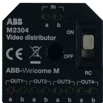
ABB Welcome™ M2304 Video distributor