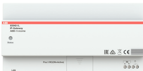
ABB Welcome™ 83342-500 IP Gateway

The IP Gateway enables integration of smartphones and devices (iOS and Google's Android™) to the door entry system. The IP-Gateway has a user interface that can be reached via an Internet browser.