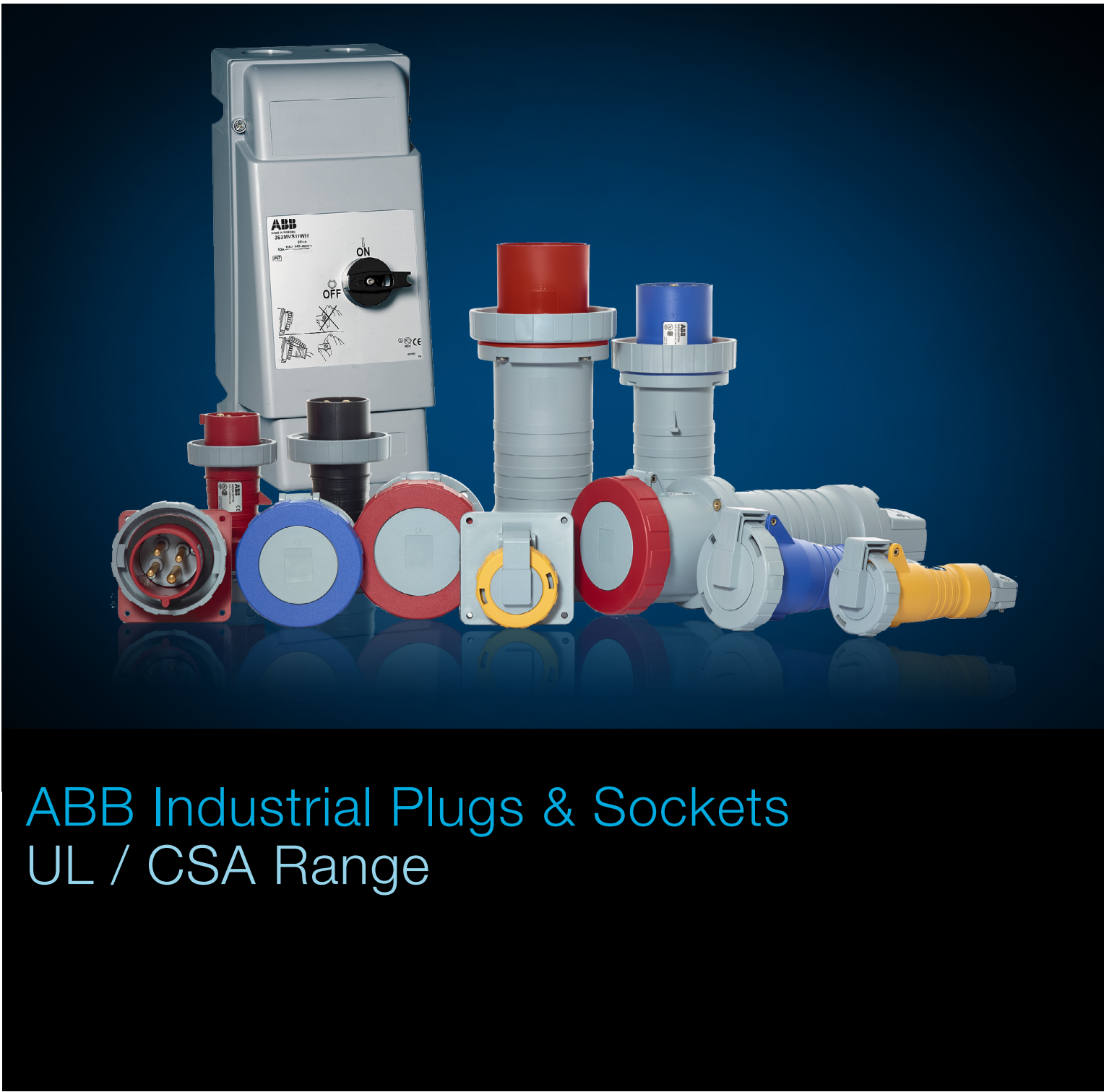
ABB Industrial Plugs & Sockets UL / CSA Range