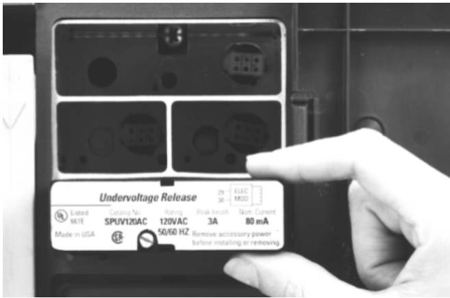
Figure 3. Inserting the Undervoltage Release into the accessory compartment.