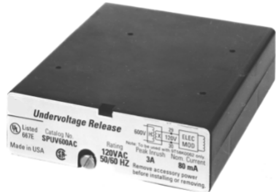
Figure 1. Undervoltage Release.

When the applied control voltage is above 80% of the UVR's rated value, the breaker can be closed. When the voltage drops to 35–60% of the rated value, the UVR will trip the breaker.