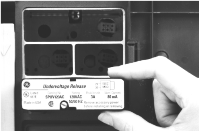
Figure 3. Inserting the Undervoltage Release into the accessory compartment.