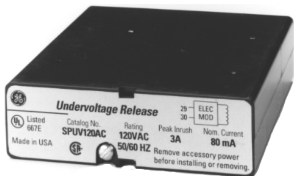
Figure 1. Undervoltage Release.

The catalog numbers for the UVR for various voltage applications are listed in Table 1.