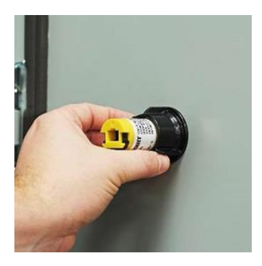
3. Tighten the panel nut until both it and the sealing washer make full contact with the enclosure surface. Then, tighten an additional <sup>1</sup>/<sub>4</sub> turn. Tighten the panel nut with fingers only, do not overtighten .