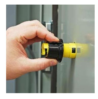
2. Install the panel nut with the flange towards the inside surface of the enclosure.