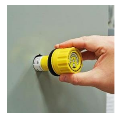
1. Remove the indicator module (yellow device) from the packaging and insert in the 30mm knockout hole, aligning the antirotation notch. Ensure the rubber washer is on the outside of the enclosure.