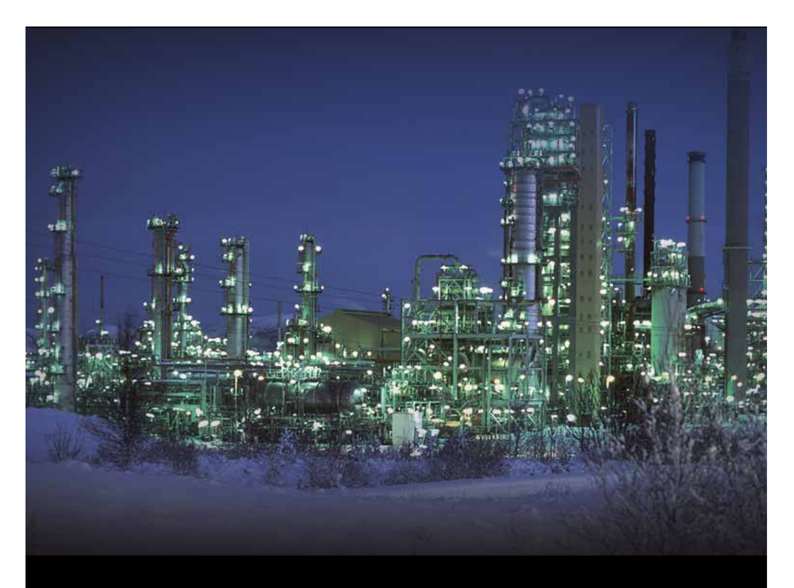
ABB SACE LTT -40 °C circuit-breakers Special version for low temperature environments