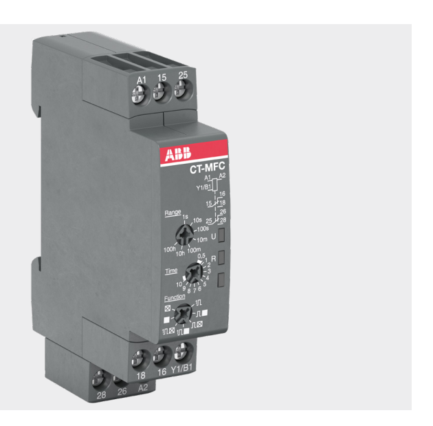
ABB time relays provide simple, reliable and economical control solutions in all types of panels. They are typically used in industrial applications and OEM equipment, providing time-delayed switching to start a motor, control a load or manage a process.

The CT-C range combines lower cost with higher value and performance by offering essential functions in a 17.5 mm housing, freeing up room in any control cabinet. The range includes 14 devices, offering both single and multi-functional types, with a time range from 0.05 seconds to 100 hours. Equipped with wide voltage ranges, CT-C time relays allow for use across a huge variety of applications worldwide.