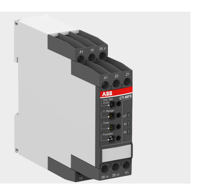
ABB time relays provide simple, reliable and economical control solutions in all types of panels. They are typically used in industrial applications and OEM equipment, providing time-delayed switching to start a motor, control a load or manage a process.

The advanced CT-S range is ABB's universal range of electronic timers. It includes 22 single-function devices and 16 multifunction time relays, offering flexibility in operation with up to 13 functions. The devices feature seven or ten time ranges, adjustable from 0.05 seconds to 300 hours. Additionally, every device is available in two different connection technologies: familiar double-chamber cage connection terminals (screw terminals) and ABB's vibration-resistant Easy Connect technology (push-in terminals).