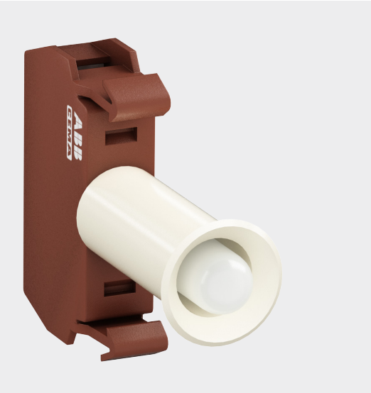
ABB pilot devices are engineered for total reliability. Our products are tested to extremes and proven in the toughest environments. Their innovative designs simplify the entire process, from selection to installation.

Modular LED blocks P9PL is our most versatile range with high level of flexibility and market leading electrical ratings. Engineered for total reliability, longer lifetime, and highest mechanical durability. Self-cleaning contacts ensure reliable operation without the need for maintenance, increasing uptime. High degree of protection guarantee reliability in extreme environments. The innovative design simplifies the entire process, from selection to easy and quick, tool-free installation. The perfect solution for every application.