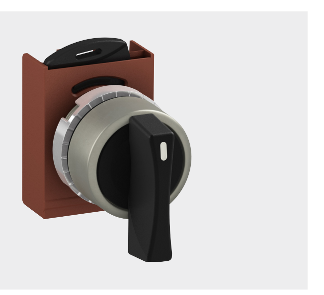
ABB pilot devices are engineered for total reliability. Our products are tested to extremes and proven in the toughest environments. Their innovative designs simplify the entire process, from selection to installation.

Modular selector switches P9MS is our most versatile range with high level of flexibility and market leading electrical ratings. Engineered for total reliability, longer lifetime, and highest mechanical durability. Self-cleaning contacts ensure reliable operation without the need for maintenance, increasing uptime. High degree of protection guarantee reliability in extreme environments. The innovative design simplifies the entire process, from selection to easy and quick, tool-free installation. The perfect solution for every application.