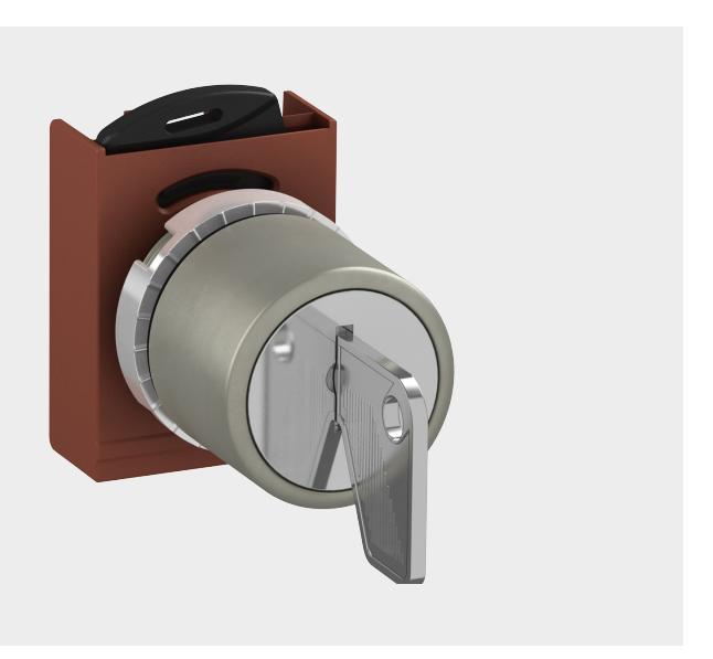
ABB pilot devices are engineered for total reliability. Our products are tested to extremes and proven in the toughest environments. Their innovative designs simplify the entire process, from selection to installation.

Modular key-operated selector switches P9MSC is our most versatile range with high level of flexibility and market leading electrical ratings. Engineered for total reliability, longer lifetime, and highest mechanical durability. Self-cleaning contacts ensure reliable operation without the need for maintenance, increasing uptime. High degree of protection guarantee reliability in extreme environments. The innovative design simplifies the entire process, from selection to easy and quick, tool-free installation. The perfect solution for every application.