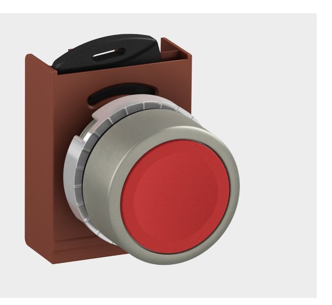
ABB pilot devices are engineered for total reliability. Our products are tested to extremes and proven in the toughest environments. Their innovative designs simplify the entire process, from selection to installation.

Modular pushbuttons P9MP is our most versatile range with high level of flexibility and market leading electrical ratings. Engineered for total reliability, longer lifetime, and highest mechanical durability. Self-cleaning contacts ensure reliable operation without the need for maintenance, increasing uptime. High degree of protection guarantee reliability in extreme environments. The innovative design simplifies the entire process, from selection to easy and quick, tool-free installation. The perfect solution for every application.