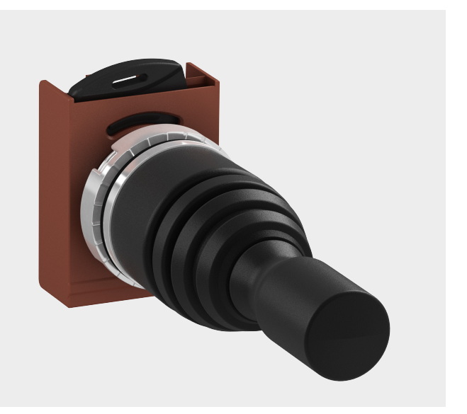
ABB pilot devices are engineered for total reliability. Our products are tested to extremes and proven in the toughest environments. Their innovative designs simplify the entire process, from selection to installation.

Modular joysticks P9MM is our most versatile range with high level of flexibility and market leading electrical ratings. Engineered for total reliability, longer lifetime, and highest mechanical durability. Self-cleaning contacts ensure reliable operation without the need for maintenance, increasing uptime. High degree of protection guarantee reliability in extreme environments. The innovative design simplifies the entire process, from selection to easy and quick, tool-free installation. The perfect solution for every application.