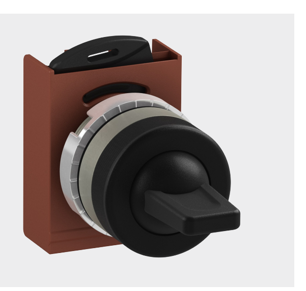
ABB pilot devices are engineered for total reliability. Our products are tested to extremes and proven in the toughest environments. Their innovative designs simplify the entire process, from selection to installation.

Modular toggle switches P9MC is our most versatile range with high level of flexibility and market leading electrical ratings. Engineered for total reliability, longer lifetime, and highest mechanical durability. Self-cleaning contacts ensure reliable operation without the need for maintenance, increasing uptime. High degree of protection guarantee reliability in extreme environments. The innovative design simplifies the entire process, from selection to easy and quick, tool-free installation. The perfect solution for every application.