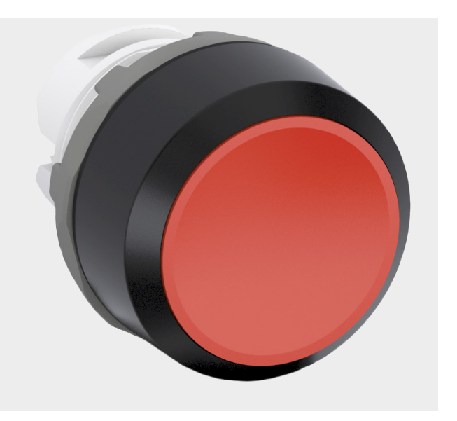
ABB pilot devices are engineered for total reliability. Our products are tested to extremes and proven in the toughest environments. Their innovative designs simplify the entire process, from selection to installation.

The modular pushbuttons MP are our most versatile range with high level of flexibility and market leading electrical ratings. Engineered for total reliability, longer lifetime, and highest mechanical durability. Self-cleaning contacts ensure reliable operation without the need for maintenance, increasing uptime. High degree of protection guarantee reliability in extreme environments. The innovative design simplifies the entire process, from selection to easy and quick, tool-free installation. The perfect solution for every application.