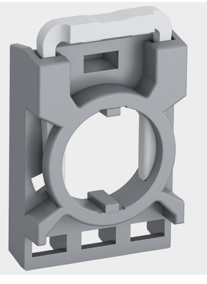
ABB pilot devices are engineered for total reliability. Our products are tested to extremes and proven in the toughest environments. Their innovative designs simplify the entire process, from selection to installation.

The contact block holders MCBH are ABB's most versatile range with high level of flexibility and market leading electrical ratings. Engineered for total reliability, longer lifetime, and highest mechanical durability. Self-cleaning contacts ensure reliable operation without the need for maintenance, increasing uptime. High degree of protection guarantee reliability in extreme environments. The innovative design simplifies the entire process, from selection to easy and quick, tool-free installation. The perfect solution for every application.