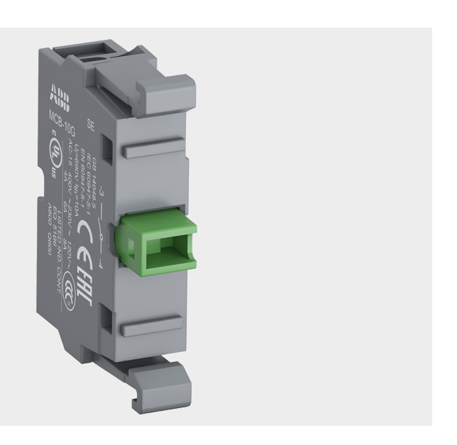
ABB pilot devices are engineered for total reliability. Our products are tested to extremes and proven in the toughest environments. Their innovative designs simplify the entire process, from selection to installation.

Contact blocks MCB are our most versatile range with high level of flexibility and market leading electrical ratings. Engineered for total reliability, longer lifetime, and highest mechanical durability. Self-cleaning contacts ensure reliable operation without the need for maintenance, increasing uptime. High degree of protection guarantee reliability in extreme environments. The innovative design simplifies the entire process, from selection to easy and quick, tool-free installation. The perfect solution for every application.