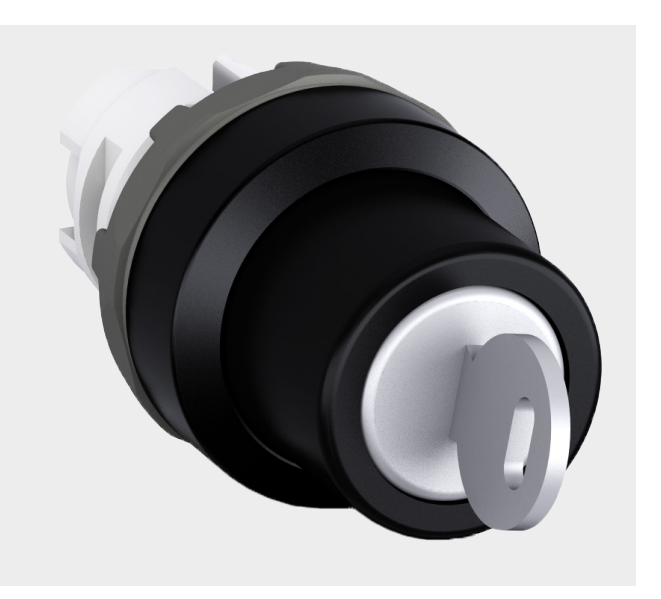
ABB pilot devices are engineered for total reliability. Our products are tested to extremes and proven in the toughest environments. Their innovative designs simplify the entire process, from selection to installation.

Modular key-operated selector switches M2SSK, M3SSK are our most versatile range with high level of flexibility and market leading electrical ratings. Engineered for total reliability, longer lifetime, and highest mechanical durability. Self-cleaning contacts ensure reliable operation without the need for maintenance, increasing uptime. High degree of protection guarantee reliability in extreme environments. The innovative design simplifies the entire process, from selection to easy and quick, tool-free installation. The perfect solution for every application.