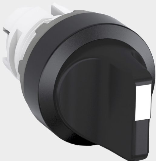
ABB pilot devices are engineered for total reliability. Our products are tested to extremes and proven in the toughest environments. Their innovative designs simplify the entire process, from selection to installation.

Modular selector switches M2SS M3SS M4SS are our most versatile range with high level of flexibility and market leading electrical ratings. Engineered for total reliability, longer lifetime, and highest mechanical durability. Self-cleaning contacts ensure reliable operation without the need for maintenance, increasing uptime. High degree of protection guarantee reliability in extreme environments. The innovative design simplifies the entire process, from selection to easy and quick, tool-free installation. The perfect solution for every application.