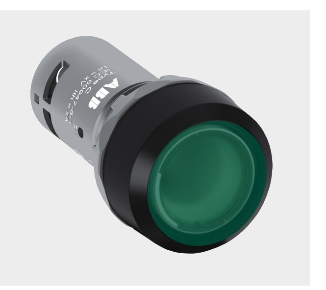
ABB pilot devices are engineered for total reliability. Our products are tested to extremes and proven in the toughest environments. Their innovative designs simplify the entire process, from selection to installation.

The compact illuminated pushbuttons CP is the most efficient solution reducing both installation time and cost thanks to the all-in-one design. It is perfect for tough environment thanks to the market leading level of dust and water resistance.