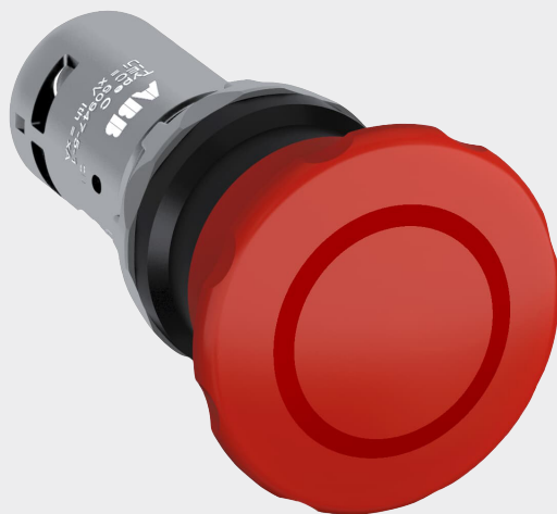
ABB pilot devices are engineered for total reliability. Our products are tested to extremes and proven in the toughest environments. Their innovative designs simplify the entire process, from selection to installation.

The compact emergency stop pushbuttons CE are the most efficient solution reducing both installation time and cost thanks to the all-in-one design. It is perfect for tough environment thanks to the market leading level of dust and water resistance.