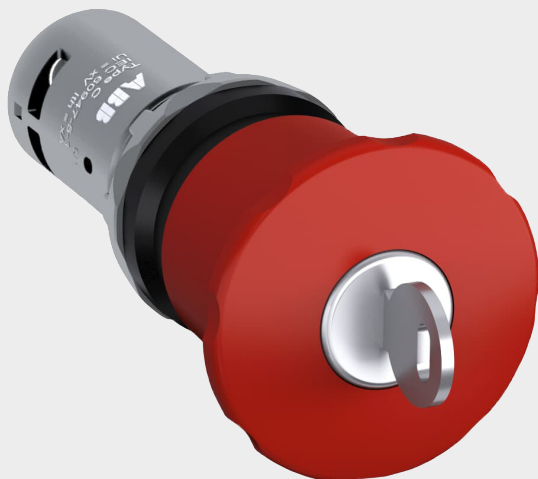
ABB pilot devices are engineered for total reliability. Our products are tested to extremes and proven in the toughest environments. Their innovative designs simplify the entire process, from selection to installation.

The Compact emergency stop pushbuttons with key CE3K CE4K are the most efficient solution reducing both installation time and cost thanks to the all-in-one design. It is perfect for tough environment thanks to the market leading level of dust and water resistance.