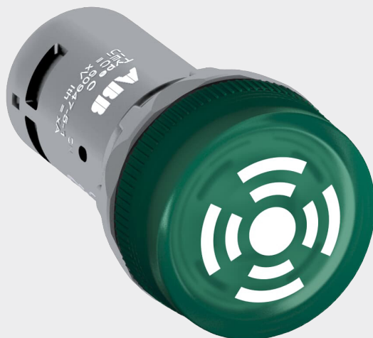
ABB pilot devices are engineered for total reliability. Our products are tested to extremes and proven in the toughest environments. Their innovative designs simplify the entire process, from selection to installation.

The compact buzzers CB are the most efficient solution reducing both installation time and cost thanks to the all-in-one design. It is perfect for tough environment thanks to the market leading level of dust and water resistance.