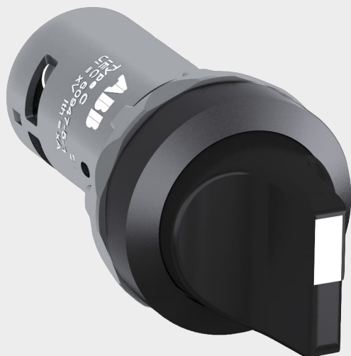
ABB pilot devices are engineered for total reliability. Our products are tested to extremes and proven in the toughest environments. Their innovative designs simplify the entire process, from selection to installation.

The compact selector switches C2SS C3SS are the most efficient solution reducing both installation time and cost thanks to the all-in-one design. It is perfect for tough environment thanks to the market leading level of dust and water resistance.