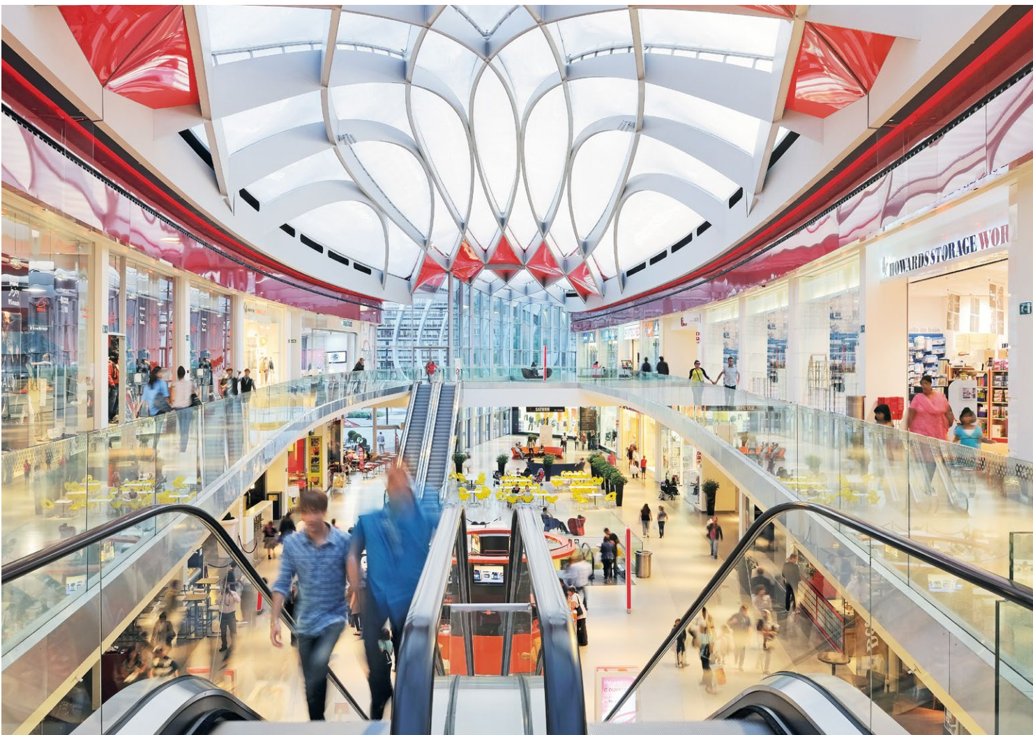
Médiacité shopping and entertainment centre at Liège, Belgium.

ORES is the company name of the electricity and gas distribution grids operator owned by eight regional electricity distributors in Wallonia, i.e. Ideg, IEH, IGH, Interost, Interlux, Intermosane, Sedilec and Simogel. ORES supplies some 1.4 million customers with a total of around 12 TWh of electricity a year. Currently ORES employs about 2,300 persons. The new multi-functional complex of Médiacité is situated in Longdoz in the city of Liège. Médiacité combines commerce, leisure, culture and media, and is expected to draw up to 7 million visitors a year with its 58,000 m 2 of shopping area, cinemas and related services.