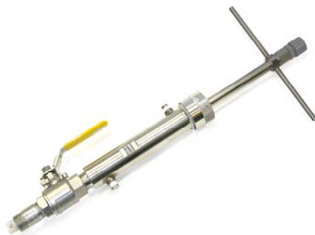
The TB(X)587 is ideal for retractable installations up to 150 psig (10 BAR).