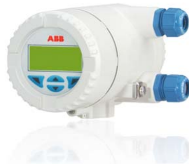
New APA592 Endura Transmitter with Exd housing.