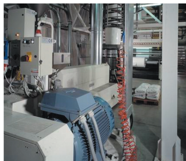
ABB drives excel in a variety of winding applications. From wire to tissue paper, ABB drives feature special winder software that maximizes the quality and efficiency of your wound product.