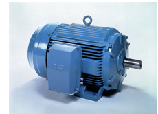
ABB Control Products

Low Voltage AC motors from ABB range from ¼ hp to 800 hp and voltages from 208 to 480 V. A wide range of Medium Voltage AC and Low Voltage DC motors are also available.