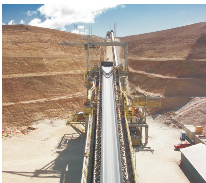
ABB offers drives that are designed to meet the requirements of specific industries or applications. This offering includes drives that have been type approved by ABS, DNV and Lloyd's. Drives for HVAC, drives for crane applications, drives for extruder applications, and more are offered. Please contact ABB or one of ABB's channel partners for more information.