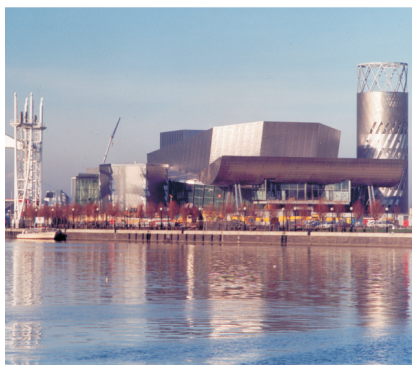
ABB provides best-in-class engineered product solutions and services that improve productivity. This includes the capability to modify and customize products that meet customer and project needs. Specifically, ABB has developed a tailored business model that focuses on eliminating non-value added activities, maintaining a high level of product quality, and providing a reliable delivery model with lead times that meet customer defined requirements. ABB's customer-centric philosophy and commitment to collaborative efforts enhances and fosters business growth for both customers and the company.