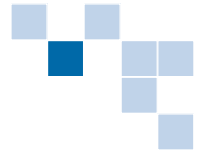
ABB Drives is the world's leading supplier of AC and DC drive products and systems for use in industrial, commercial and residential applications, improving the manageability, efficiency and energy economy of processes. Below is a sample of where our products are being used in various applications: