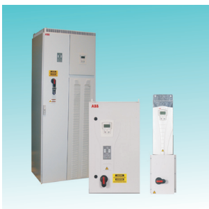
ABB Provides a wide variety of packaged drive solutions for industrial applications. Pre-engineered packages make it easy to utilize ABB drives with a selection of required control, power, and interface options, to meet specific requirements. In addition, Industry, Application and Customer-Specific Drive Packages can be offered as solutions tailored to the specific needs of customers.