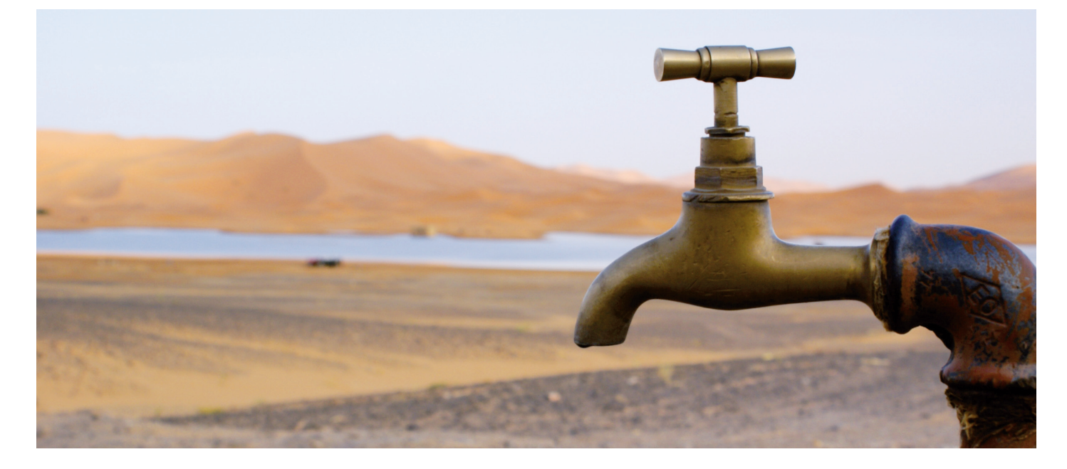
ABB: a leader worldwide

For nearly 50 years, ABB has been equipping thousands of water plants and networks, providing products, systems and services in over 100 countries worldwide. ABB provides expertise and solutions for all activities related to the water lifecycle, from water intake to re-introduction into the environment.