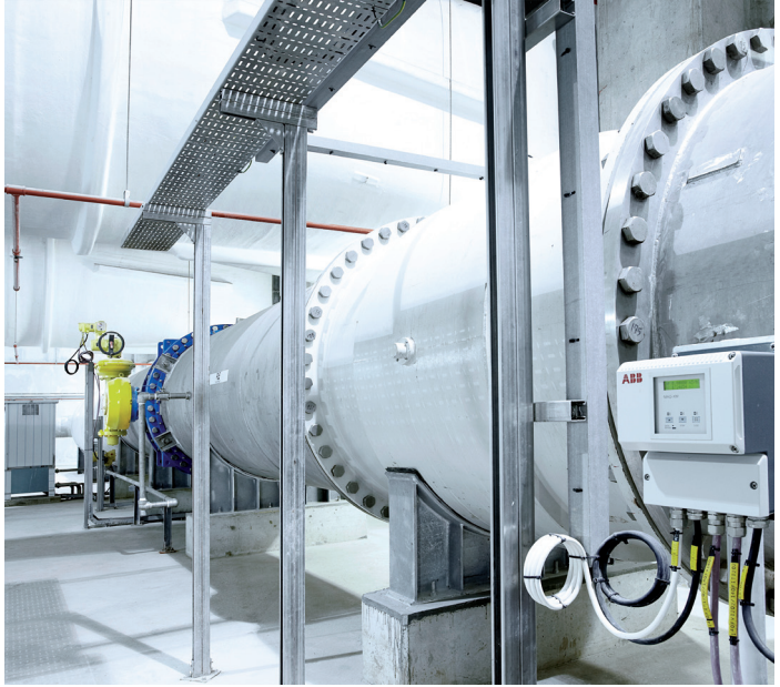
ABB can provide complex automation and control solutions from engineering to startup: distributed control systems (DCS), supervisory control and data acquisition systems (SCADA).

The ABB portfolio includes a wide range of advanced and flexible automation and control products: variable speed drives and soft starters, programmable logic controllers (PLC), remote terminal units (RTU), communication devices and human machine interfaces (HMI).