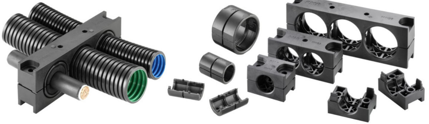
— BGPM modular multiple conduit and cable clamping system provides total modular configuration flexibility to clamp any combination of conduits and/or cables

PMAFIX Pro fitting required the introduction of two component injection molding technologies in the PMA manufacturing facility.