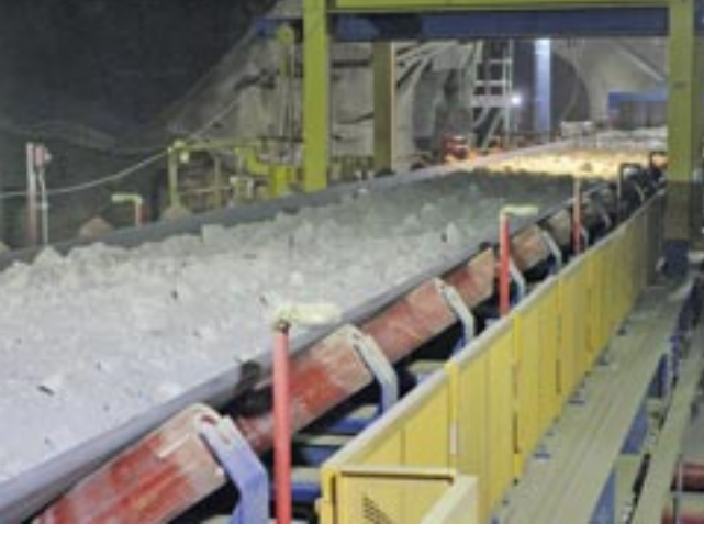
First ore on the new conveyor at Codelco Chuiquicamata Underground in 2019

The underground system (comprising two conveyors of about equal length) as well as the overland conveyor boast advanced gearless drive technology provided by drive technology partner, ABB . Gearless drives eliminate the need for a gearbox, hereby significantly reducing the number of main wear parts, which results in increased efficiency and reliability, as well as less maintenance being required. Further advantages include a considerable reduction in the drive system's footprint and the amount of