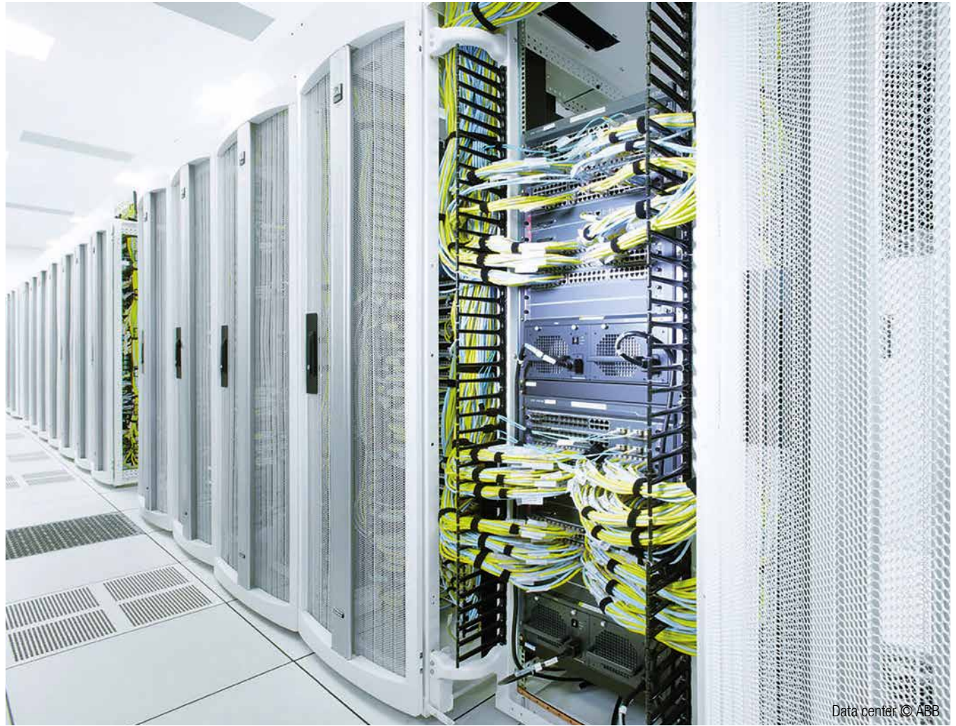
Data centers are very energy-intensive as they need to run 24 hours a day. Efficient drive and motor packages can help reduce energy costs.