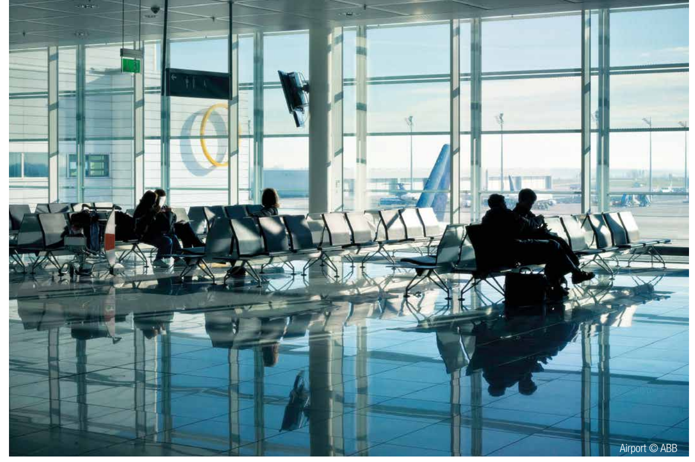
Airports and other facilities require efficient and reliable building automation and HVAC systems.