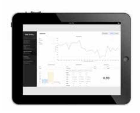
ABB Ability™ Electrical Distribution Control System

ABB Ability™ Electrical Distribution Control System (EDCS) is a cloud platform that records, optimizes and analyzes the flow of energy within the energy supply system. Thanks to the cloud architecture developed together with Microsoft®, the system is accessible anywhere and at any time, thus ensuring the highest level of reliability and security. Through a web app interface, ABB Ability™ EDCS supports users around the clock in their monitoring, optimization and control activities via smartphone, tablet or PC. ABB Ability™ EDCS also offers multi-user access and the ability to compare performance simultaneously across multiple systems.