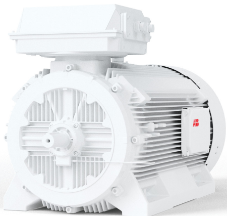
ABB Ability™ Smart Sensor for motors Installation with aluminum clamping bracket

IMPORTANT! Read these instructions in their entirety before installing the ABB Ability™ Smart Sensor for hazardous areas with aluminum clamping bracket.