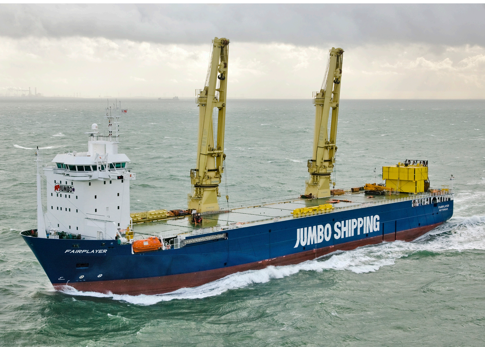
ABB Ability™ Marine Advisory System – OCTOPUS Project Cargo vessels