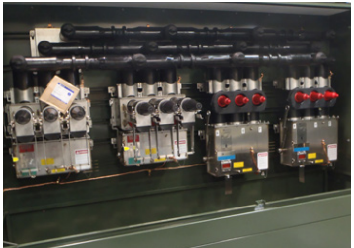
Single-sided padmount unit