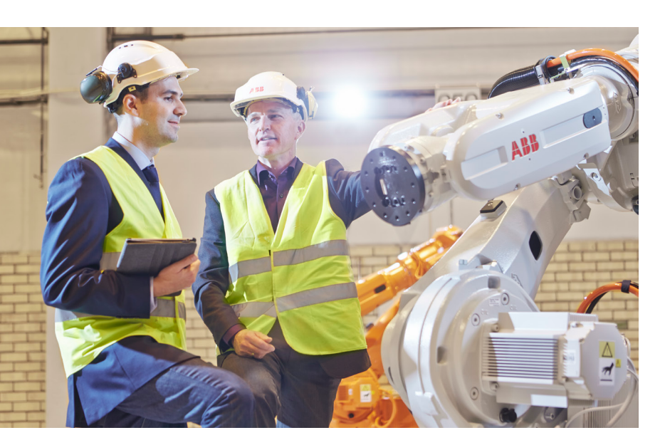
ABB certified Remanufactured Customer Robot Property has undergone a rigorous manufacturing process to a "likenew" condition, providing the same quality, performance, reliability and durability as a new robot.