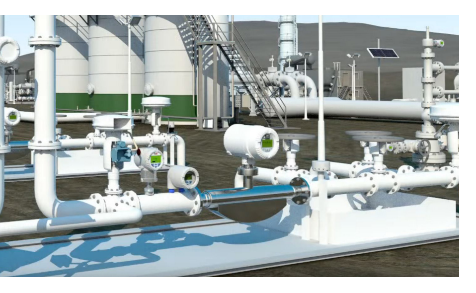
ABB Metering Modules are bundled, pre-tested solutions that help improve the accuracy of fiscal metering, blending and pressure reduction for your oil and gas products.

Ensure precise measurement of oil and gas products