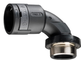
Connector 90° curved elbow with metal thread IP68 metric thread