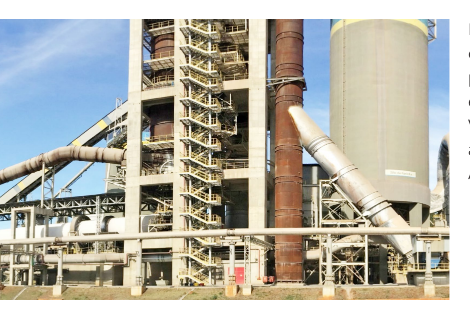
ABB successfully increased process stability and reduced energy cost at Votorantim Cimentos

Imagine you worrying less about ore grade variation impacting your process stability and associated energy consumption. The team at Votorantim Cimentos in Brazil is already living this reality thanks to ABB Ability<sup>™</sup> Expert Optimizer.