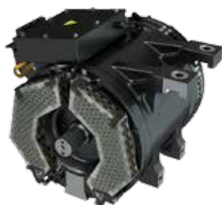
ABB metro motors

ABB offers customized traction motors based on pre-defined and proven technology platforms. We select technologies for e.g. rotors, suspension and cooling to cost-effectively tailor motors according to customer specification.